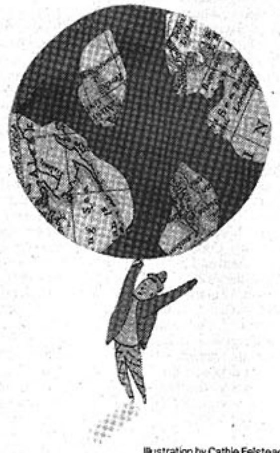
Illustration by Cathie Felstead