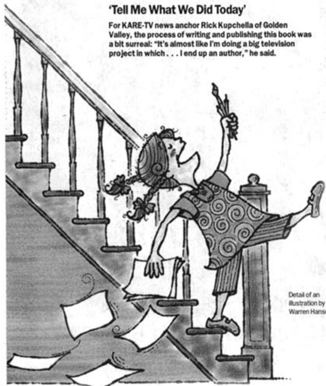
Detail of an illustration by Warren Hanson